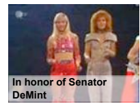
In honor of Senator DeMint