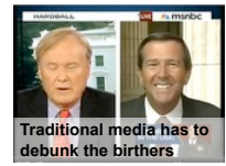
Traditional media has to debunk the birthers