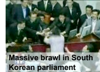
Massive brawl in South Korean parliament