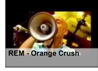
REM - Orange Crush