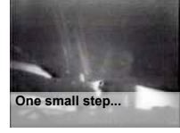
One small step...