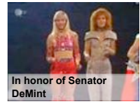
In honor of Senator DeMint