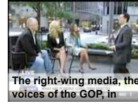
The right-wing media, the voices of the GOP, in