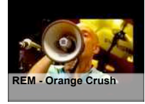
REM - Orange Crush