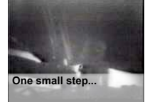
One small step...