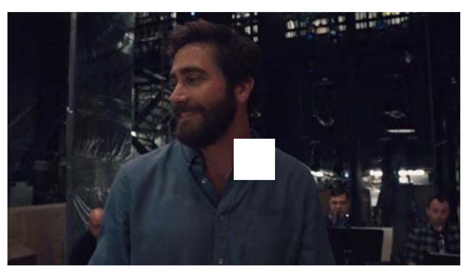
Sneak Peek: Sunday in the Park with George