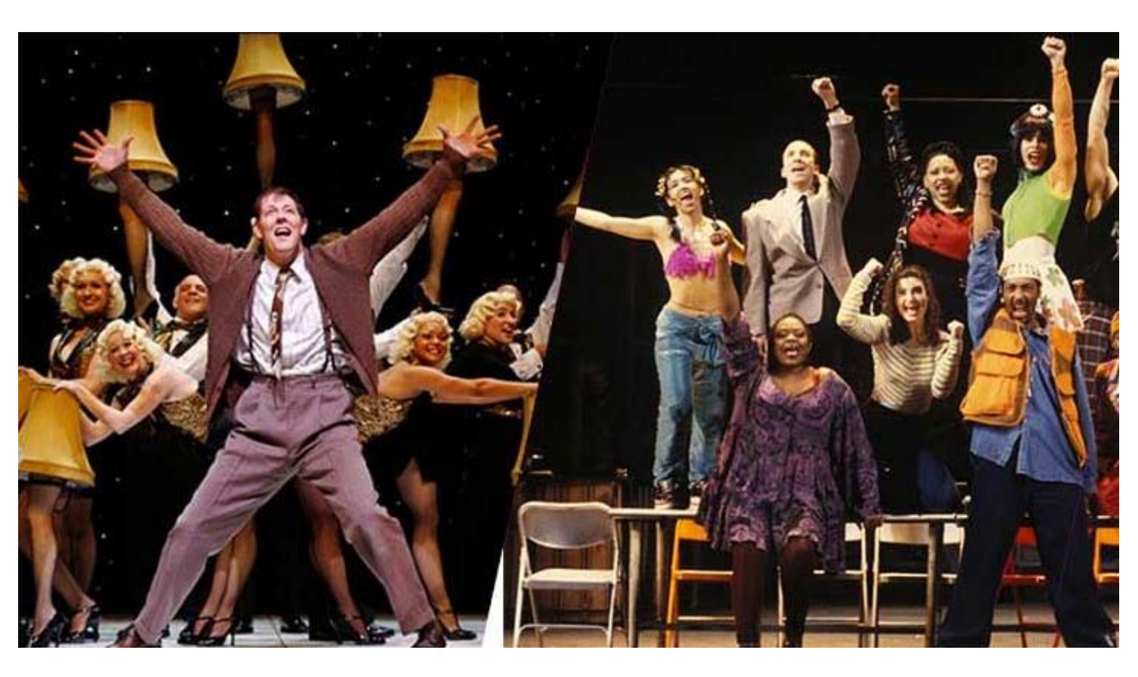
A Christmas Story and Rent to Receive Live TV Productions