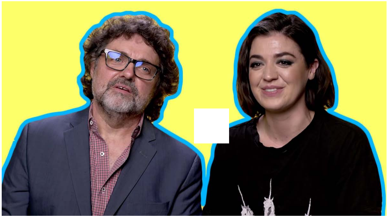
Mean Girls on Broadway: "I'd Rather Be Me" Official Lyrics & Meaning