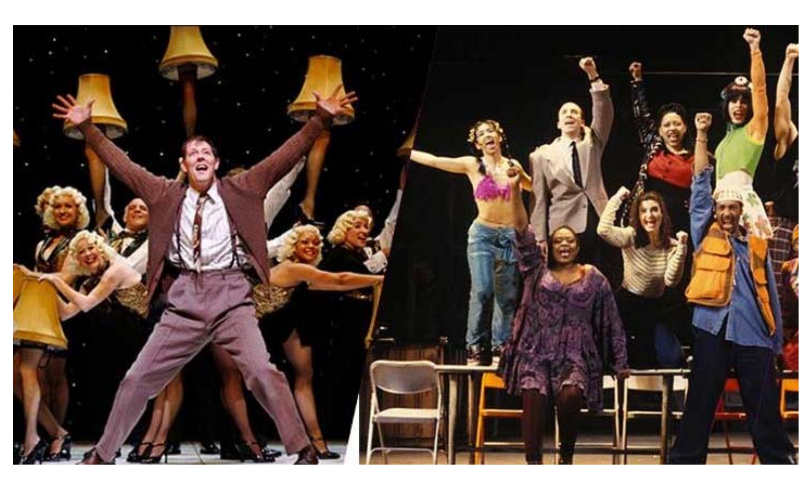
A Christmas Story and Rent to Receive Live TV Productions