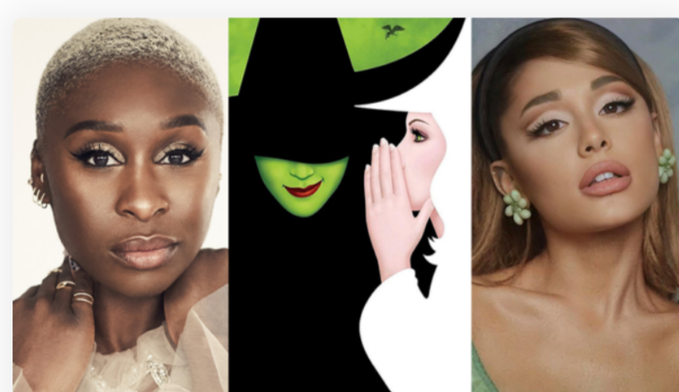
Cynthia Erivo & Ariana Grande to Star in Wicked Film Adaptation