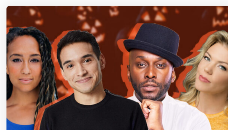
Broadway Stars Share Their Favorite Halloween Costumes