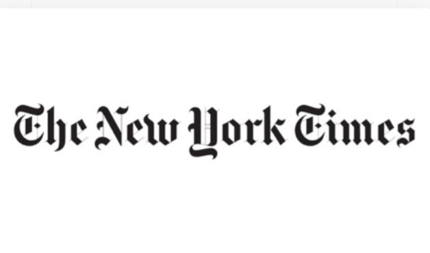
New York Times Theatre Critic Ben Brantley to Step Down