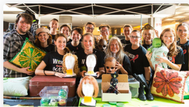
Broadway Flea Market & Grand Auction Moves Online in 2020