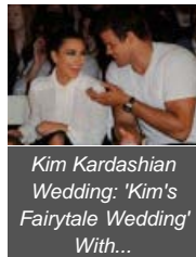
Kim Kardashian Wedding: 'Kim's Fairytale Wedding' With...