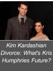
Kim Kardashian Divorce: What's Kris Humphries Future?