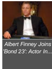
Albert Finney Joins 'Bond 23': Actor In...