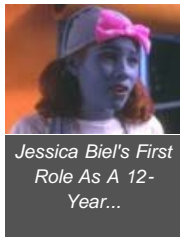
Jessica Biel's First Role As A 12-Year...