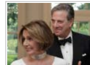
Nancy Pelosi Wears Vintage Thierry Mugler To