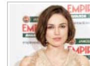
Knightley Gets Dangerous