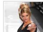
Kirstie Alley Walks NYFW