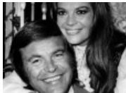
Robert Wagner: Murder Suspect On 'NCIS'