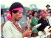
Jimi Hendrix Named Greatest Guitarist Of All...