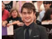
Daniel Radcliffe Almost Wasn't Harry Potter