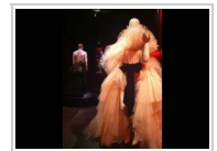
Jean Paul Gaultier: From the Catwalk to the...