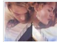
Going Back To 'Titanic'