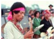
Jimi Hendrix Named Greatest Guitarist Of All...