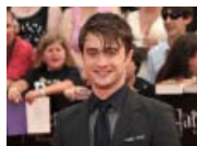
Daniel Radcliffe Almost Wasn't Harry Potter