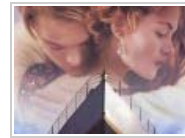
Going Back To 'Titanic'