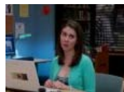
'Community': Beetlejuice Secret Easter Egg In Halloween...