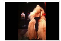
Jean Paul Gaultier: From the Catwalk to the...