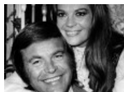
Robert Wagner: Murder Suspect On 'NCIS'