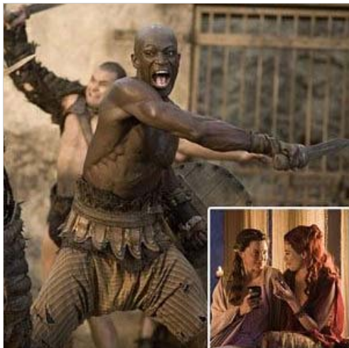
RAW RAGE: PeterMensah, Lucy Lawless (inset right) and Jaime Murray (above) stars in "Spartacus: Gods of the Arena."

"That's nothing, mate," says Lucy Lawless, the New Zealander who shot to fame as Xena and also had a major role on the acclaimed " Battlestar Galactica " reboot. "I'm forbidding my parents to watch."