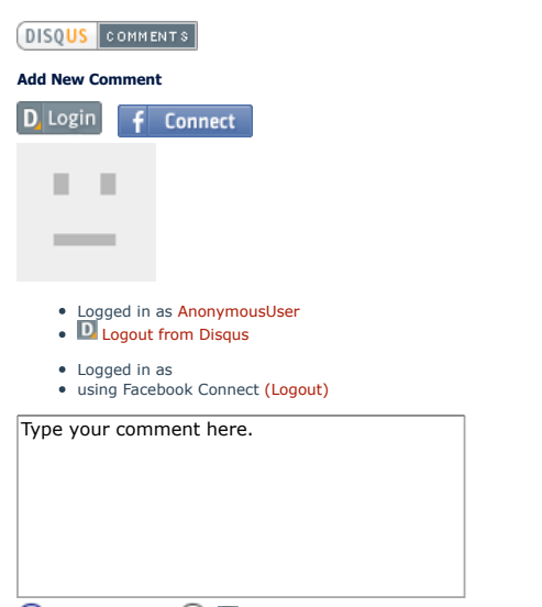
💽 Unclaimed 🛛 🔘 🔟 Register with

Middle East In Prophecy What is the future of the Middle East & Israel? Find out now free.