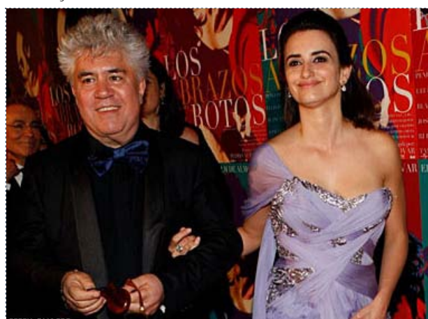
Pedro Almodóvar and Penelope Cruz

French-language film and best first or second feature.