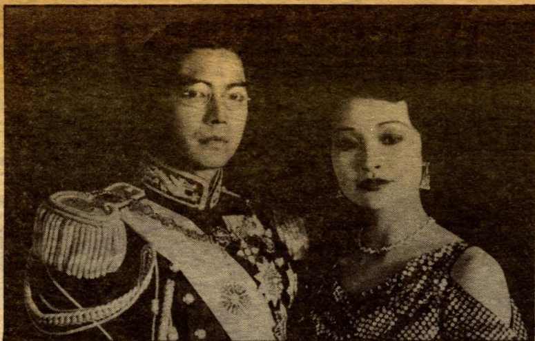
John Lone and Joan Chen were overlooked by the Academy.

category where everyone deserves to win.