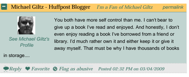
There are More Comments on this Thread. Click Here To See them All