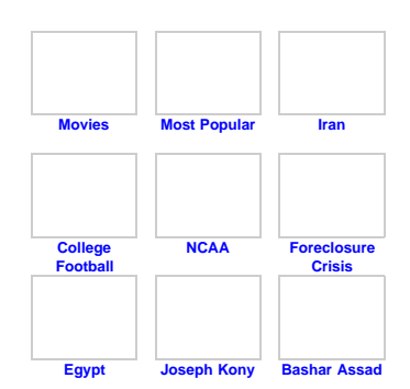
MORE BIG NEWS PAGES »