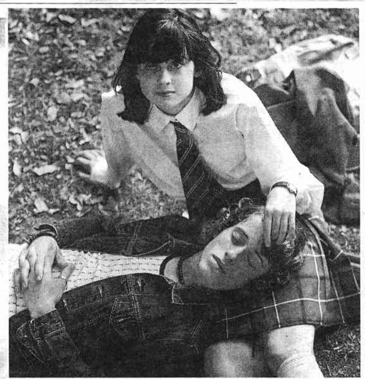
Opposite page: "Nocturna," from Spain/France, has its U.S debut at this year's film fest. Above: "32A" is about a 13-year-old Catholic schoolgirl's life in 1979 Dublin.