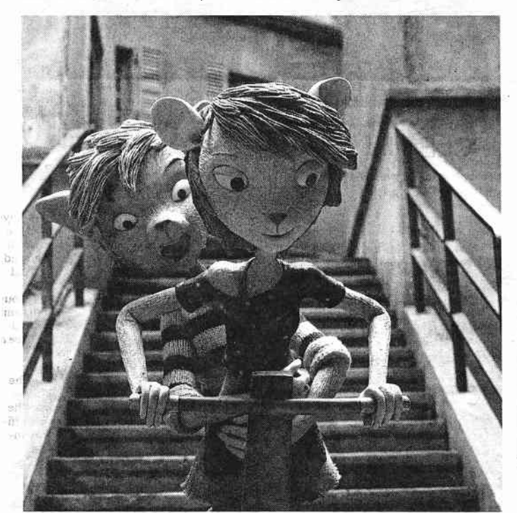
The French animated feature "Max & Co." tells the tale of a fox and a cat who discover a corporation that breeds mutant insects and then sells special fly swatters.

www.gkids.tv and that is going to be a place where kids and families and adults can watch cool short films," says Beckman, who is married and has watched his three kids grow up with his festival. (As with the actual fest, all films online are rated and detailed, so parents can choose appropriate titles for all ages.)