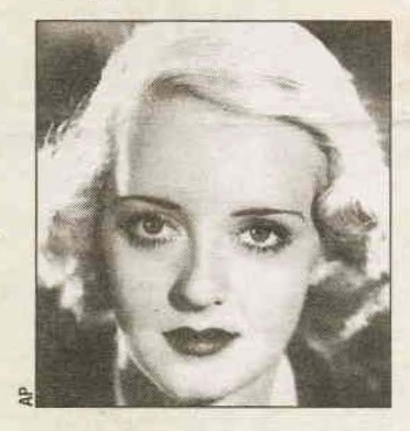
The Letter ★★½ Warner Bros., $19.97

undo this oversight by releasing his best films, including 1960's prison drama "Le Trou," 1954's noir gangster classic "Touches Pas Au Grisbi" and "Casque D'Or" a 1952 classic on a turn-of-the-century doomed romance starring Simone Signoret. The usual thoughtful extras include silent footage from the set and a TV tribute.