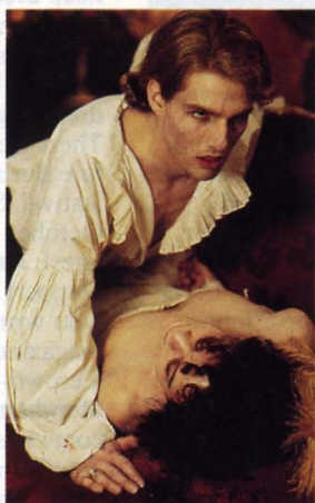
Cruise in 'Vampire.'

Disclosure, Michael Crichton's novel about sexual harassment, arrives courtesy of director Barry Levinson, who could use a hit after Toys and Jimmy Hollywood . Demi Moore