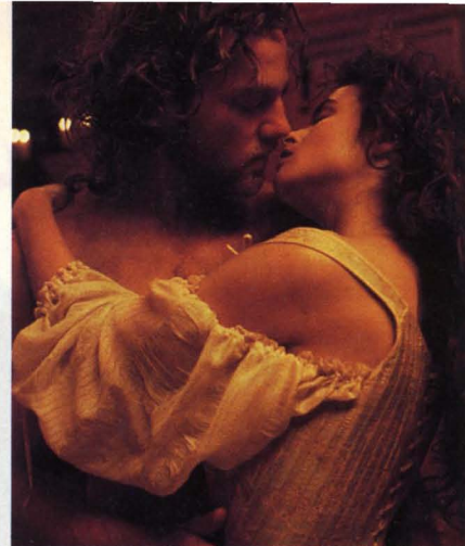
Kenneth Branagh and Helena Bonham Carter in 'Frankenstein.'

STALLONE (SYLVESTER) AND Stone (Sharon) team up in The Specialist (October 7).... Sigourney Weaver seeks revenge in Roman Polanski's Death and the Maiden (December 23).... Claude Chabrol descends into L'enfer with Emmanuelle Béart, which doesn't sound so bad (November).... Dana Delany grabs a whip in Exit to Eden (October 14).... Marisa Tomei only has eyes for Robert Downey Jr. in Only