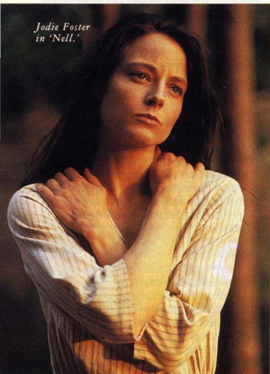
Jodie Foster in 'Nell.'

There's equally intriguing fare during the run of the festival, September 23 to October 9. Hal Hartley's latest, Amateur , has Isabelle Huppert as a former nun who writes for a porn magazine. Already pegged as a crowd-pleasing favorite is Strawberry and Chocolate , a comedy set in Havana that details the romance between David, an uptight college student, and Diego, an older, openly gay, and far more cosmopolitan man. Italian