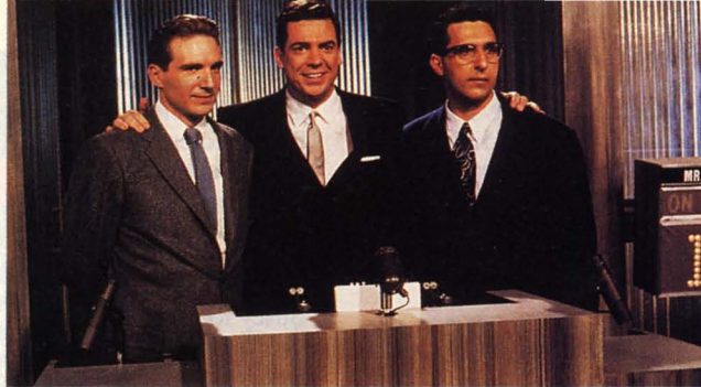
Ralph Fiennes, Christopher McDonald, John Turturro in 'Quiz Show.'

James Carville and Mary Matalin might enjoy Speechless , a political comedy about two rival speechwriters (Michael Keaton and Geena Davis) who fall in love. Which is the Democrat, and which is the Republican?