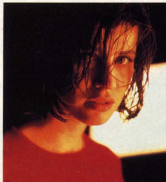
Irene Jacob in 'Red.'

Frank Darabont delivers a promising feature-film debut with The Shawshank Redemption , the Stephen King story of a convicted murderer (Tim Robbins) and his friendship with a prison lifer