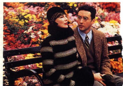
Dianne Wiest and John Cusack in Woody Allen's 'Bullets Over Broadway.'

The plot of Star Trek: Generations seems sensibly action-oriented. A rip in time brings together Captains Kirk (William Shatner) and Picard (Patrick Stewart); they unite,