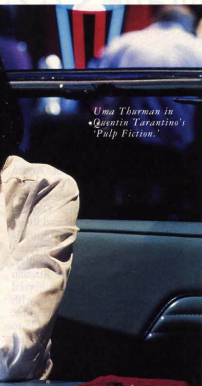
Uma Thurman in •Quentin Tarantino's 'Pulp Fiction.'