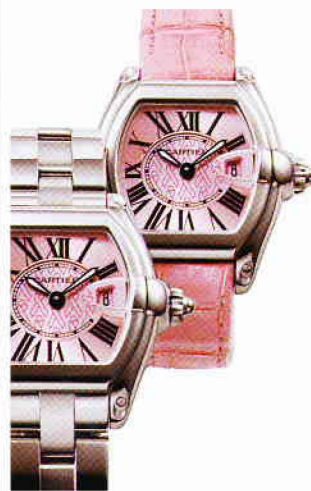
Cartier Roadster Watch

HELPING HANDS: For those in the mood to raise money and have fun at the same time, the Equestrian AIDS Foundation will hold its third annual fundraiser on Thursday, November 10, at 6:30 P.M. in Los Angeles at Amici Brentwood. Featuring incredible auction items such as phenomenal VIP packages to American Idol tapings and the Billboard Music Awards, proceeds will benefit EAF and those affected by the recent hurricanes. For further information call 800-792-6068. Looking ahead, Show Circuit hears that some of our aware young riders are joining "The Ride for Hope," a youth effort that is being