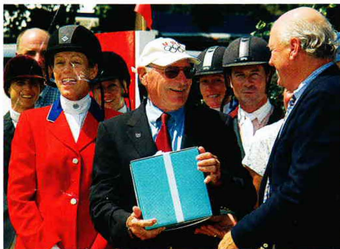
Frank Chapot (c.)