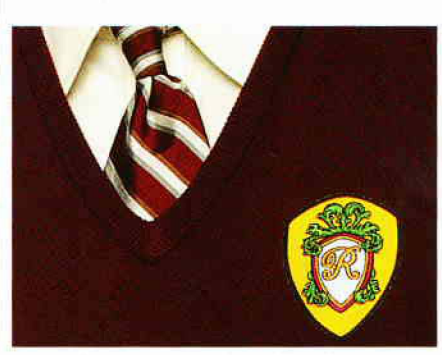
Mr. Romance is looking for a few good (equestrian) men.

charming, energetic, in great physical shape, comfortable on camera, and possess a healthy level of competitiveness." (Gee, is that all?) Men passing their interview will attend a Romance Academy to learn how to woo women—though presumably someone who is "attractive, outgoing, charming, energetic, in great physical shape" and so on wouldn't need that many lessons. Make the top ten of your class and you'll be part of the televised contest whose winner gets $50,000 and a role in an Oxygen original movie. Act fast: The auditions close for good on August 19. Call 323-468-2031 for more information.