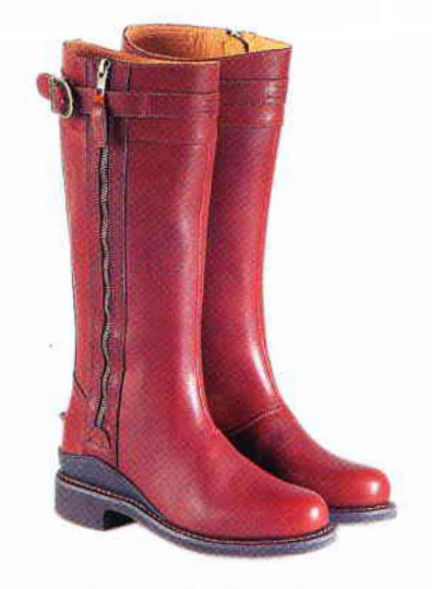
The Hunter Hamilton

AMERICA: Following on the heels of such well-known British designers as Stella McCartney and Alexander Mc-Queen, the venerable British bootmaker Hunter has made the leap across the pond and is offering its footwear in the "colonies" for the first time. Long a favorite with European riders, Hunter's equestrian boot collection includes three styles designed for use in the paddock and stable as well as on horseback. The riding boot collection includes the Masselburgh, a zip-fronted ankle jodhpur boot for men and women ($149); the Kelso, a women's ankle-high paddock boot with laced front ($169); and the Hamilton, a women's knee-high design featuring side zip and buckle ($210). All are made of water-resistant,