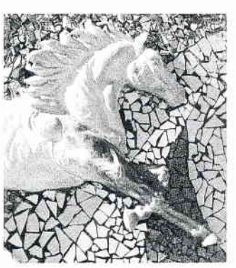
A detail of the mural Mustang Surf by Zask and students; 10' x 50', 2003–2004

Zask prefers to draw from memory instead of photographs or live models when creating her sculptures. "I just finished